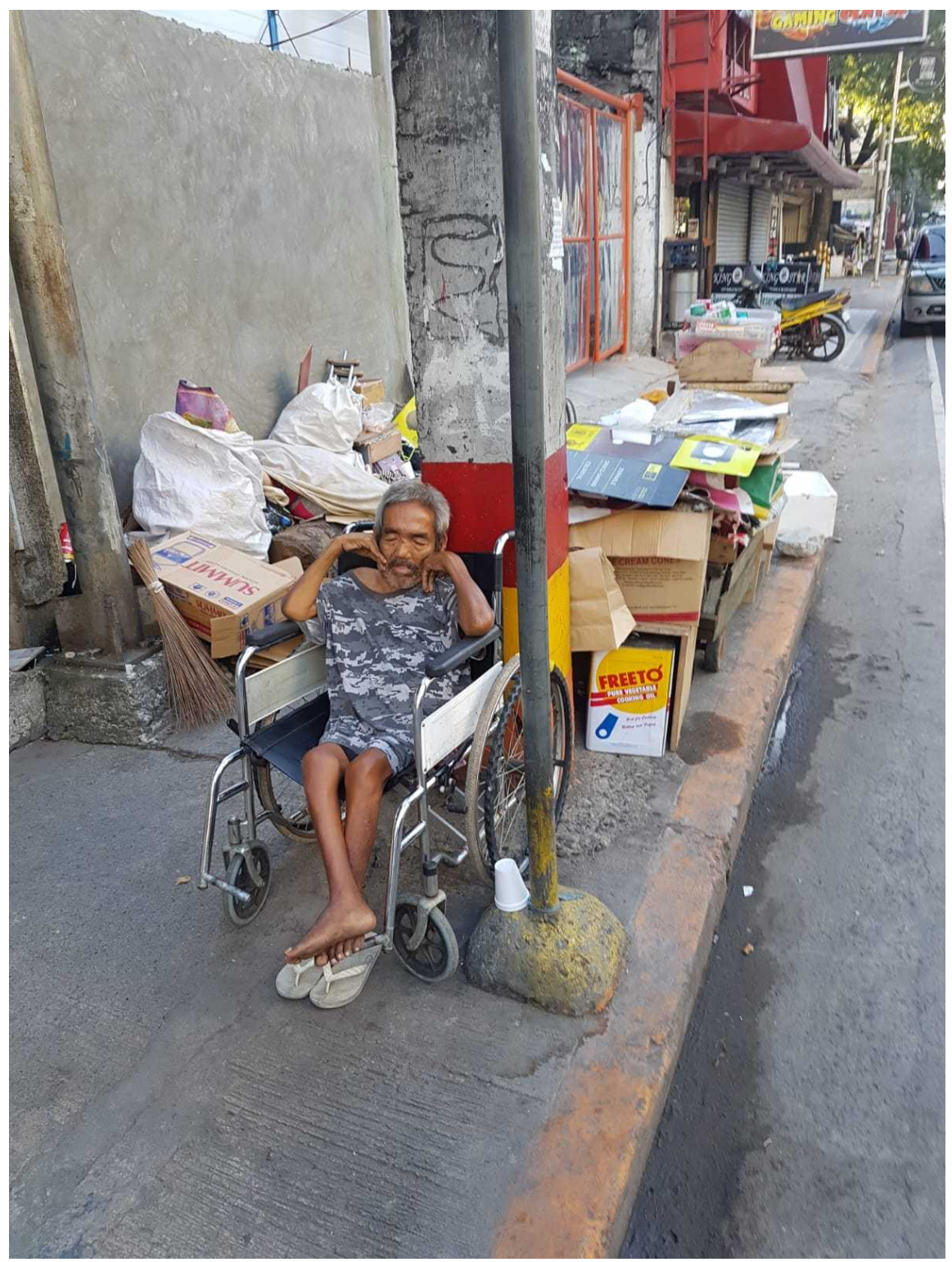
Handycapped, homeless living in the streets