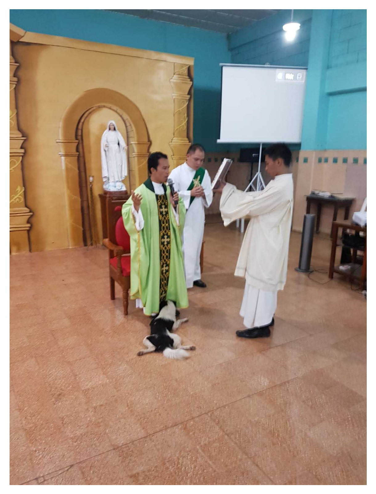
The dog listens to the Gospel in Remase, Mindanao