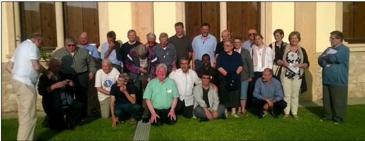
European Assembly, Verona, Italy